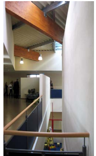
Princess Margaret Opens the New English International School